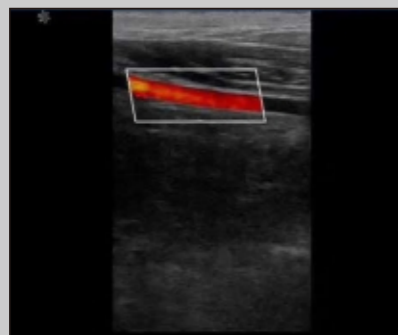
● Cat-Carotid artery